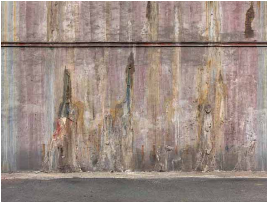
( http://www.bmiaa.com/wp-content/uploads/2016/08/Ljubodrag-ANDRIC-China-8-2013.jpg ) Ljubodrag ANDRIC – China 8, 2013 © Fondazione Querini Stampalia

These urban landscapes absent of any physical human form invite reflective contemplation as the walls are there, but not those who built them or those who lived behind them. Thus they challenge the viewer into engaging with a space inhabited by potential relationships, as we explore new visions and imbue the photographs with personal meaning and value. The dialogue generated by these images is further extended to include the space in which they are exhibited, the Fondazione Querini Stampalia , an inspiring and celebrated work of the architect Carlo Scarpa .