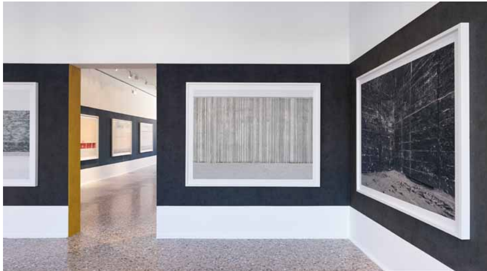
Querini Stampalia Exhibition