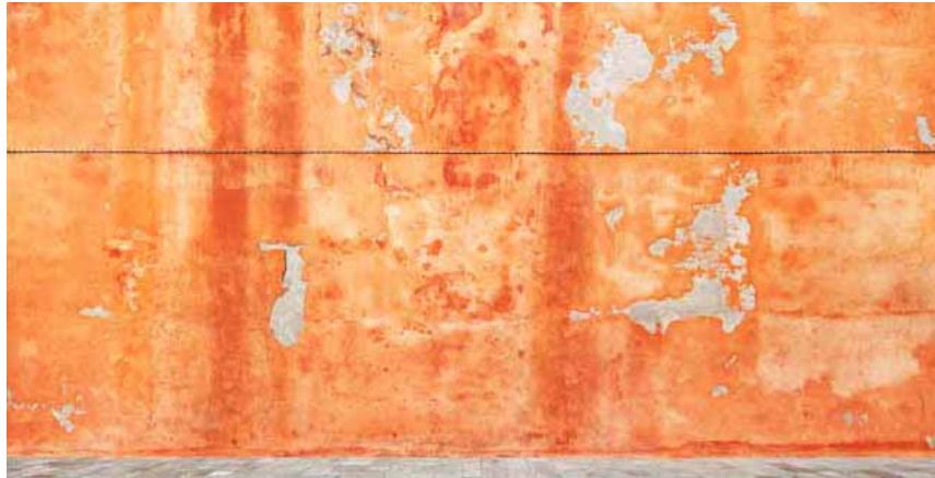
( http://www.bmiaa.com/wp-content/uploads/2016/08/Ljubodrag-ANDRIC-Venezia-2-2009.jpg ) Ljubodrag ANDRIC – Venezia 2, 2009 © Fondazione Querini Stampalia