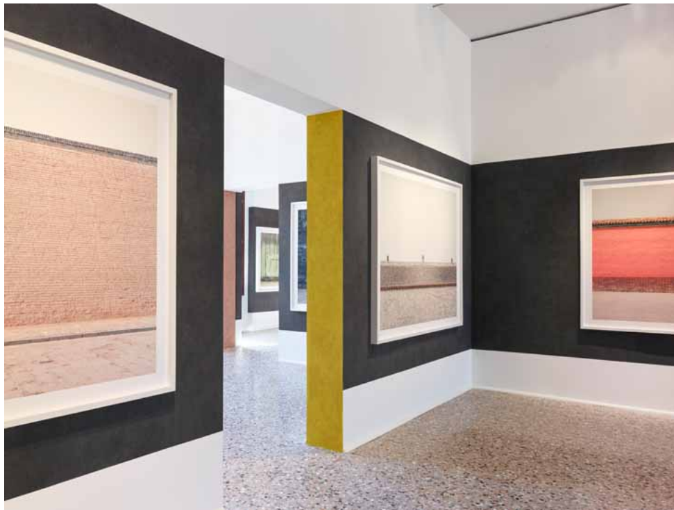
( http://www.bmiaa.com/wp-content/uploads/2016/08/Querini-Stampalia-Exhibition8234.jpg ) Querini Stampalia Exhibition © Fondazione Querini Stampalia

Tobia Scarpa also contributes to the accompanying text of the exhibition as he observes the dialogic potential of photographs. He notes, "In the powerful images by Ljubodrag Andric [...] form and human heritage are investigated in a manner devoid of pretence or presumption that invites curious and reflective contemplation as well as awakening a host of intertwining questions."