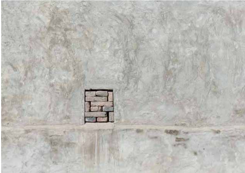
( http://www.bmiaa.com/wp-content/uploads/2016/08/Ljubodrag-ANDRIC-Pingyao-2-2015.jpg ) Ljubodrag ANDRIC – Pingyao 2, 2015 © Fondazione Querini Stampalia

These urban landscapes absent of any physical human form invite reflective contemplation as the walls are there, but not those who built them or those who lived behind them. Thus they challenge the viewer into engaging with a space inhabited by potential relationships, as we explore new visions and imbue the photographs with personal meaning and value. The dialogue generated by these images is further extended to include the space in which they are exhibited, the Fondazione Querini Stampalia , an inspiring and celebrated work of the architect Carlo Scarpa .