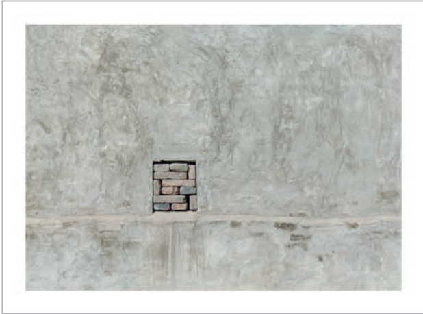
Pingyao 2, 2015