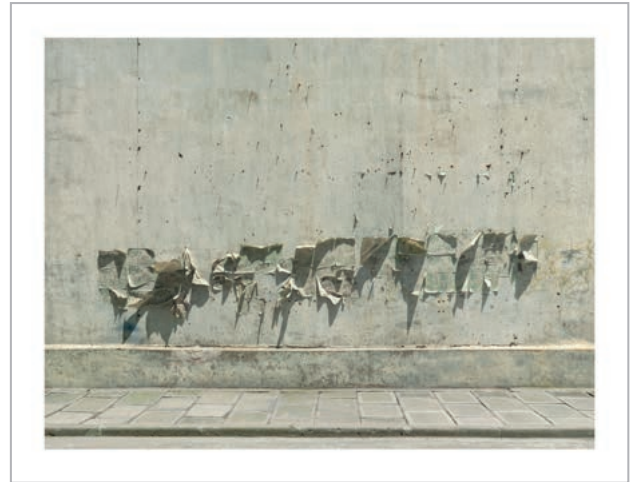
China 12, 2012