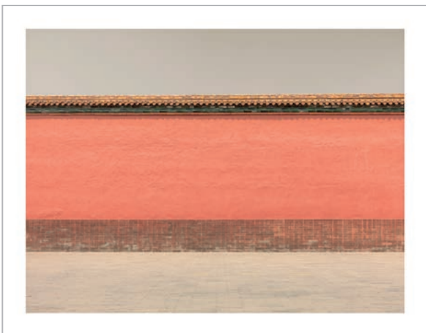
China 2, 2013