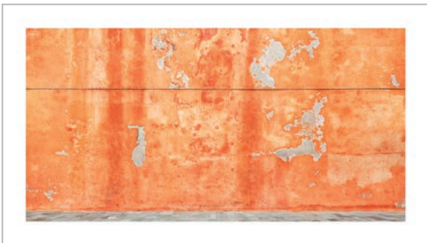
Venezia 2, 2009